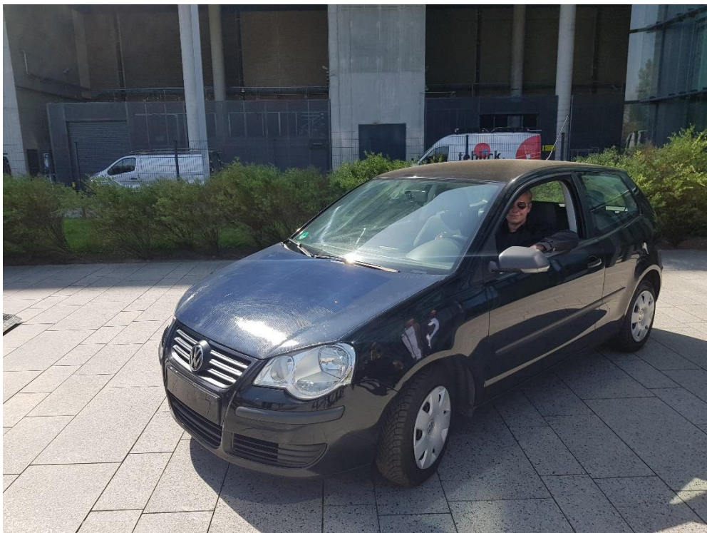
Abb. 2 Coupled with the research institute's MorphoColor® technology, the solar-active surface on the hood can be color-matched to the color of the vehicle.