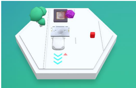
Holographic 3D projections of head-up-display while driving.