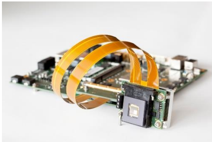
Micromirror array and matching control electronics.