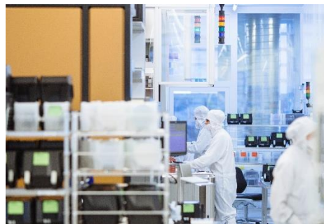
Research & Development in the 200-mm-clean-room.