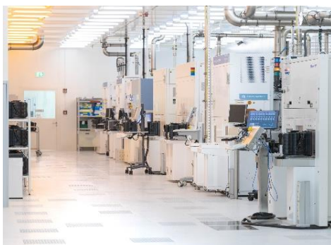
300-mm-Tools at CNT.