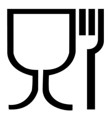
Figure 3: The Glass and Fork Symbol

The international symbol for "food safe" material is a wine glass and a fork symbol (figure 3). The symbol indicates that the material used in the product is considered as being safe for food contact. The symbol is mandatory for products sold in the EU according to the FCM framework Regulation along with specific use instructions 'if necessary'. This rule is applicable to any product intended for food contact, but not yet containing food, whether it is made of metals, ceramics, paper and board, or plastics, including food and water containers, packaging materials, cutlery etc. The use of the symbol is more significant in products which should be explicitly identified whether safe for food or not, or if there is an ambiguity whether the container could be used to hold food. The symbol is also used in North America, Europe, and parts of Asia.