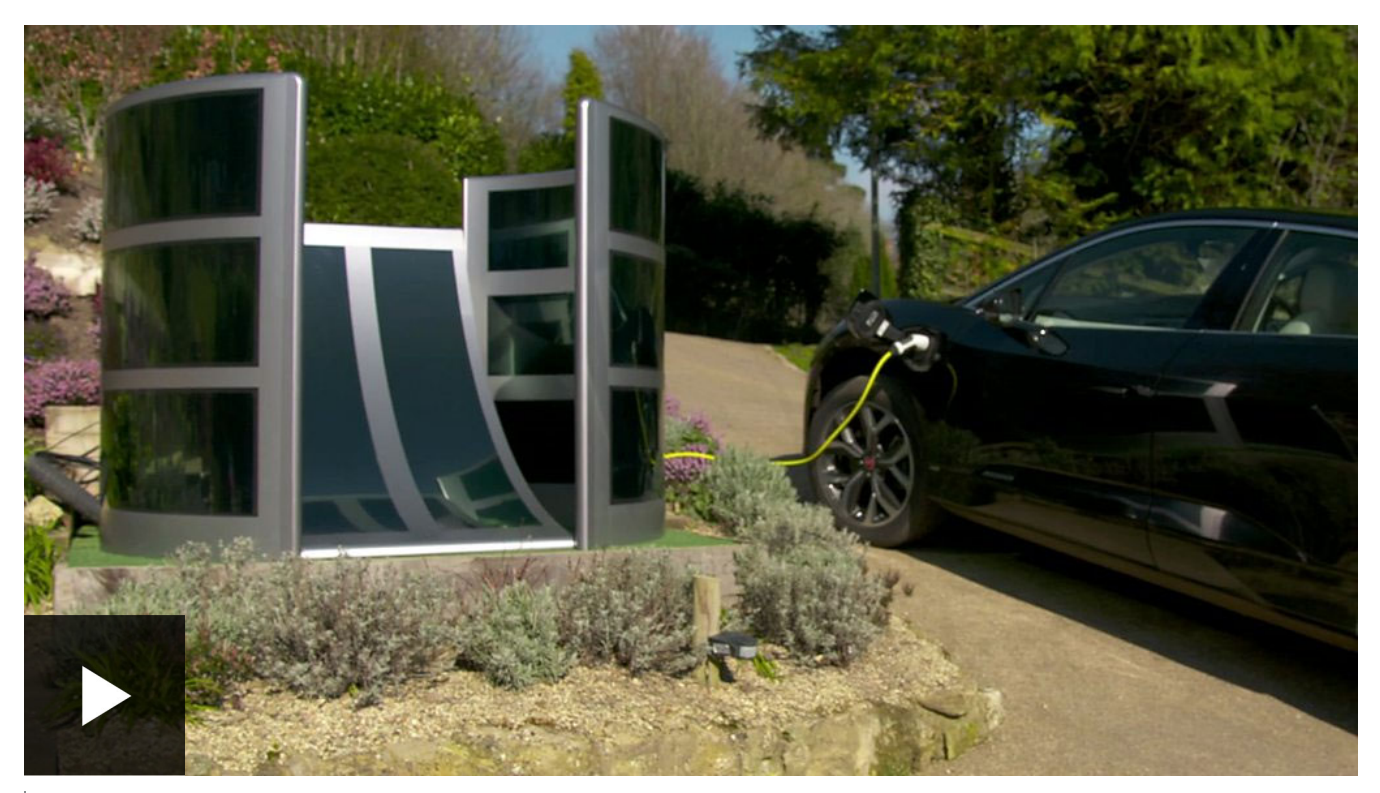
WATCH: Entrepreneurs launching alternative solar products