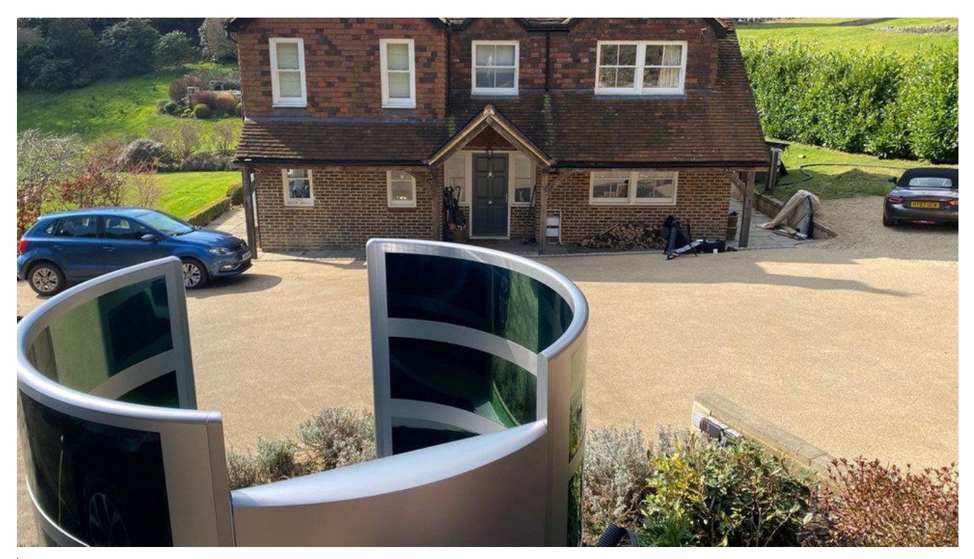
The Solivus Arc is expected to produce 1,000 kWh a year

Aiming to supply an average of 1,000 kWh a year in the UK, Solivus will guarantee the £3,500 Arc for 20 years and plans to let buyers pay in instalments.