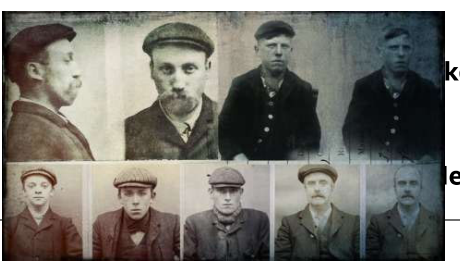
Who were the real Peaky Blinders?

The origins of a notorious street gang that arose in Birmingham